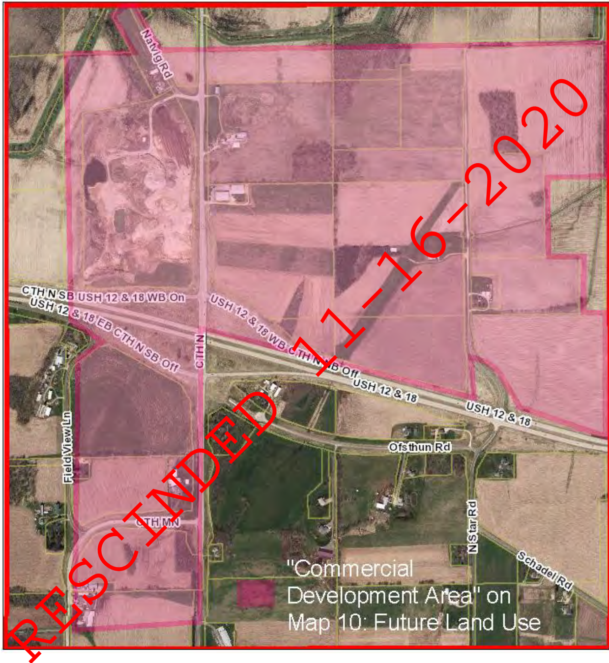
Map 11: Highway 12/18/N Interchange Area