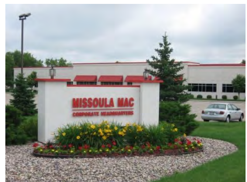
Examples of developments near the Highway 12/N interchange and within similar Town interchange areas, where urban services are limited, but where there are expectations for high development quality.